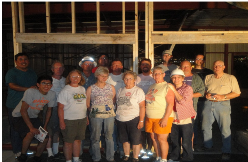
The group that erected the building.

Seeing our children running and enjoying the auditorium so much reminded me of