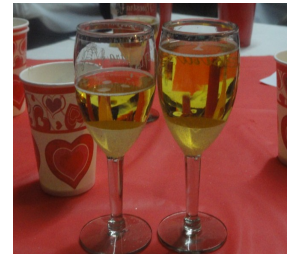
Sparkling apple cider made for a wonderful toast. It was a romantic and beautiful evening all around.