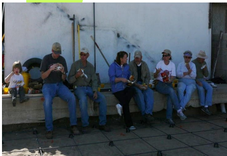
Part of the November group, taking a well-deserved break.

There are no words to describe the joy one feels when watching a centenary of children flutter around and run in our "new" back yard. One can see the small first grader glide, imitating a plane; or a group of girls jumping rope; or the other children who, marbles in hand, are competing for the right to be the best player of the morning. Of course there is always the boy running through the small crowd in an urgent hurry, running over anyone who might get in the way between him and the bathroom door –time has gone by so quickly while playing and he has just now realized that when nature calls, one must heed its voice!